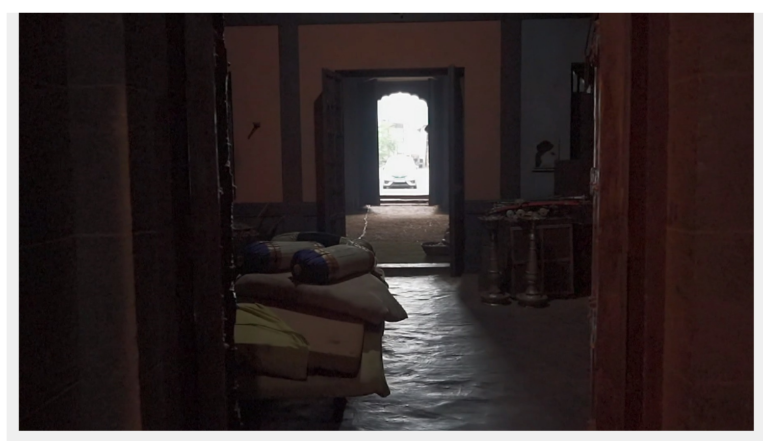
Saltanant Vally 2