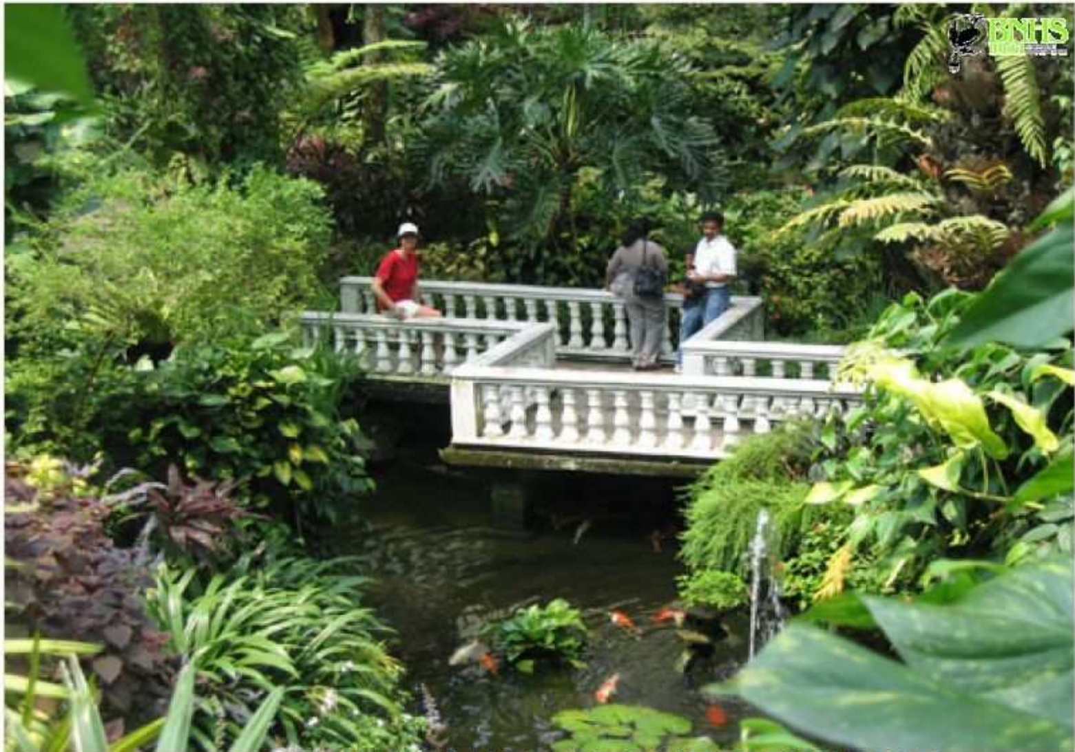
STREAM WALK OVER BRIDGE