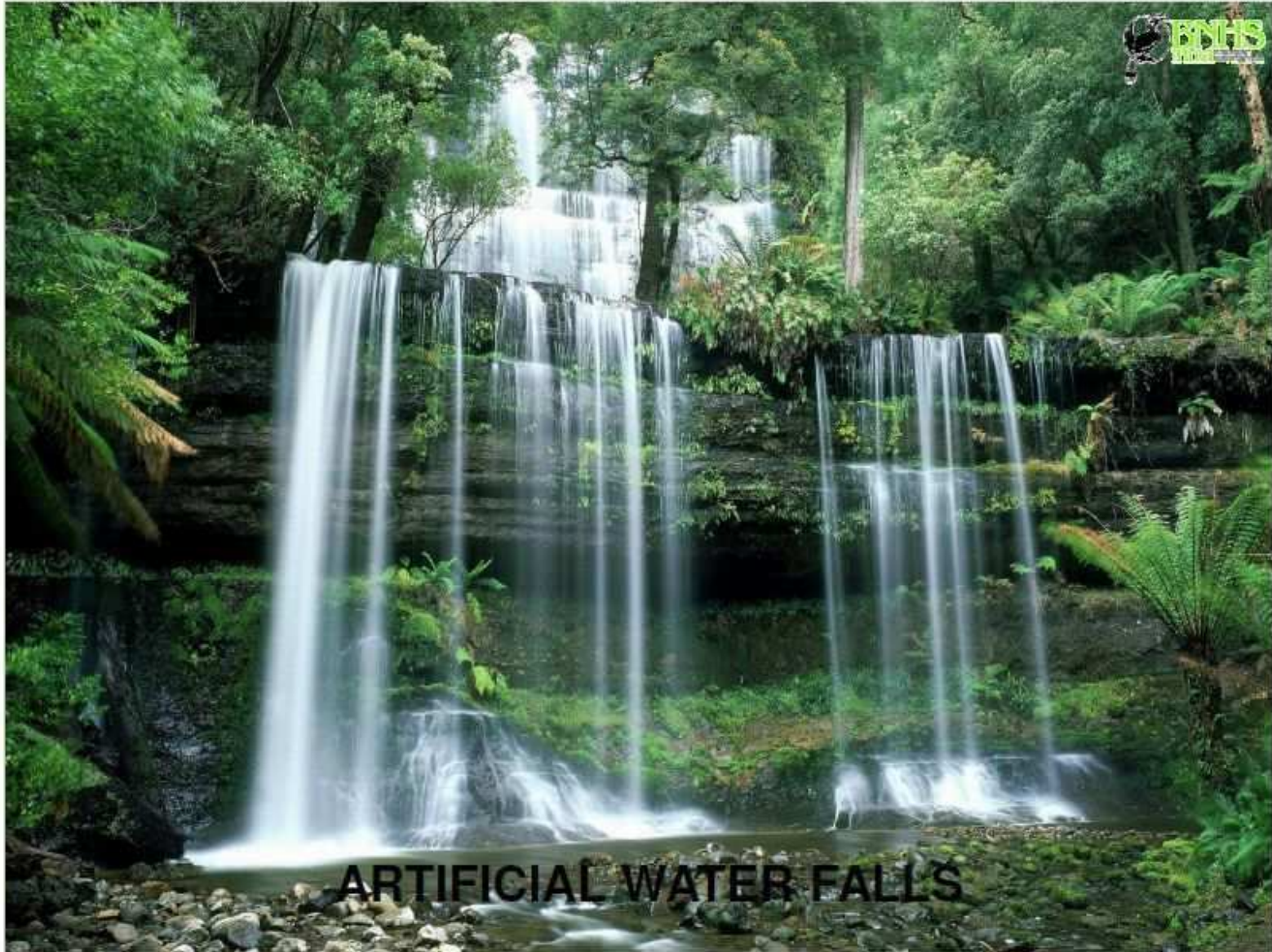
ARTIFICIAL WATER FALLS